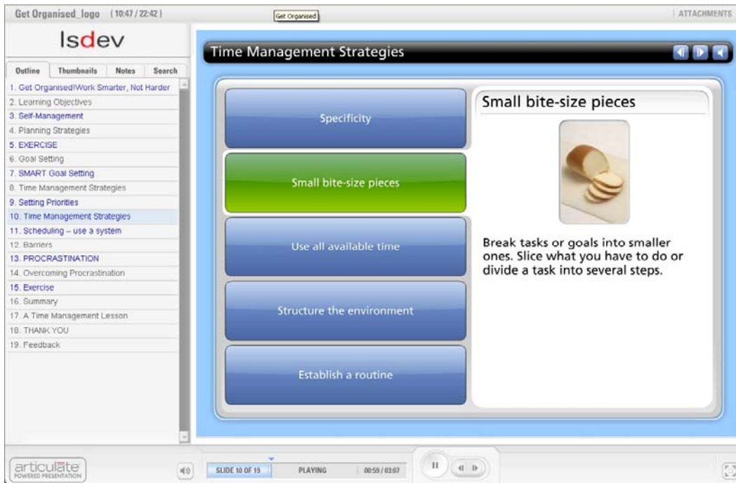
Figure 1 Get Organized online audio workshop

This online workshop was developed using a commercially available e-learning tool called Articulate Presenter and Articulate Engage. These tools allowed the educational psychologist to add narration and interactive elements for her workshop slides. The existing Powerpoint slides provided a skeleton structure, scripts were prepared and voiceovers were recorded. We also intend to include an audio file of student discussion from a face-to-face workshop around time management issues – an aspect that would typically be unavailable from an online workshop. The result is the student ‘attends’ the workshop but at their own pace with opportunities to practice and explore the material.